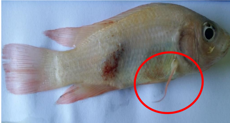
Figure 2. Coloration changes on the peritoneal part of Red tilapia Oreochromis sp. after subjecting to Aeromonas hydrophila infection (circled).