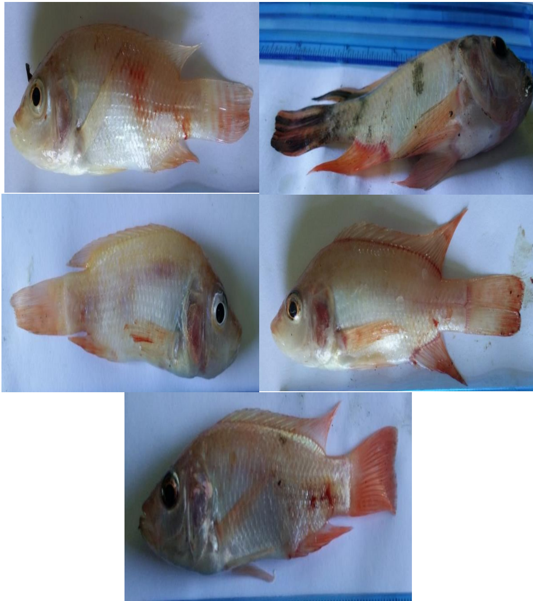
Figure 3. Ulceration, lesion, and reddening of gills and fins of Red tilapia Oreochromis sp. infected with Aeromonas hydrophila .