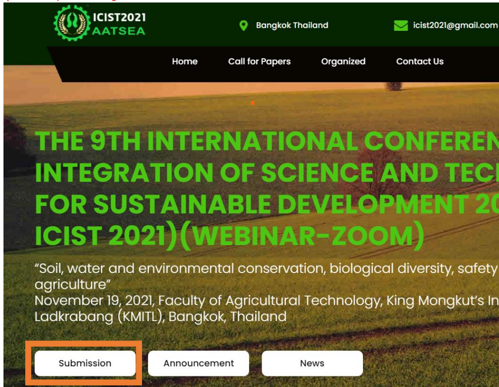
Figure1 http://www.aatsea.org/icist2021 Page

https://easychair.org/conferences/?conf=icist20212 or at Submission botton.